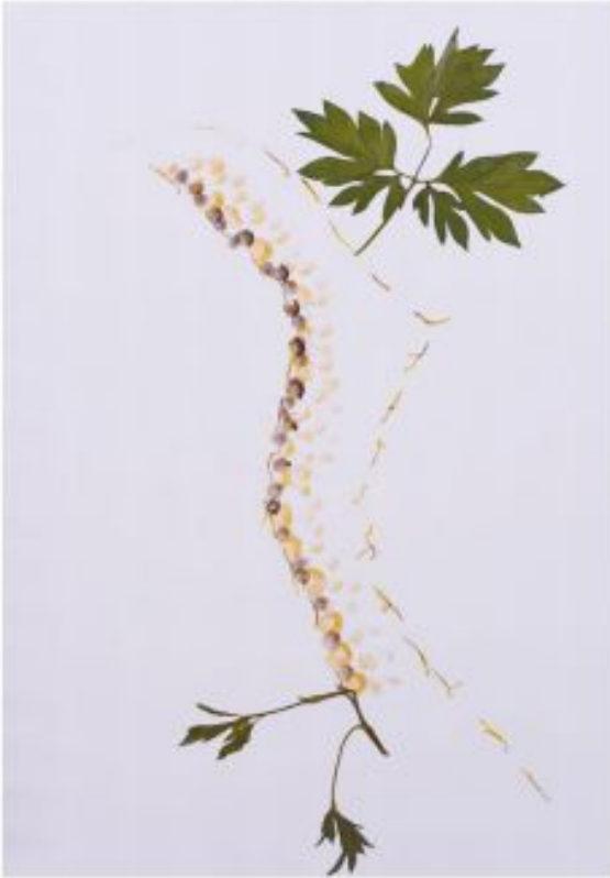
Title: Tree (Left)