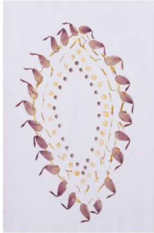
Title: Woman Drawing (Right )