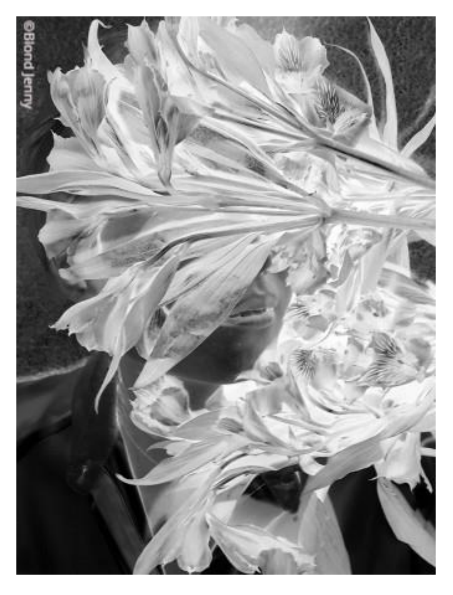
Blond Jenny Life_Negative, 2017 photo on aluminum 40 x 30 in.

These works are exemplary of the shift in focus from the paintings of the Hudson River School that revered nature as sublime to humankind's modern combative relationship with it. We are a threat, and nature as we know it is unsustainable. Botanical art has always recognized the ephemerality of the natural world, but now it has the emotional weight of investigating our role in that risk, and our responsibility to the natural world of protecting it. Representing nature in art may be the only way to save it.