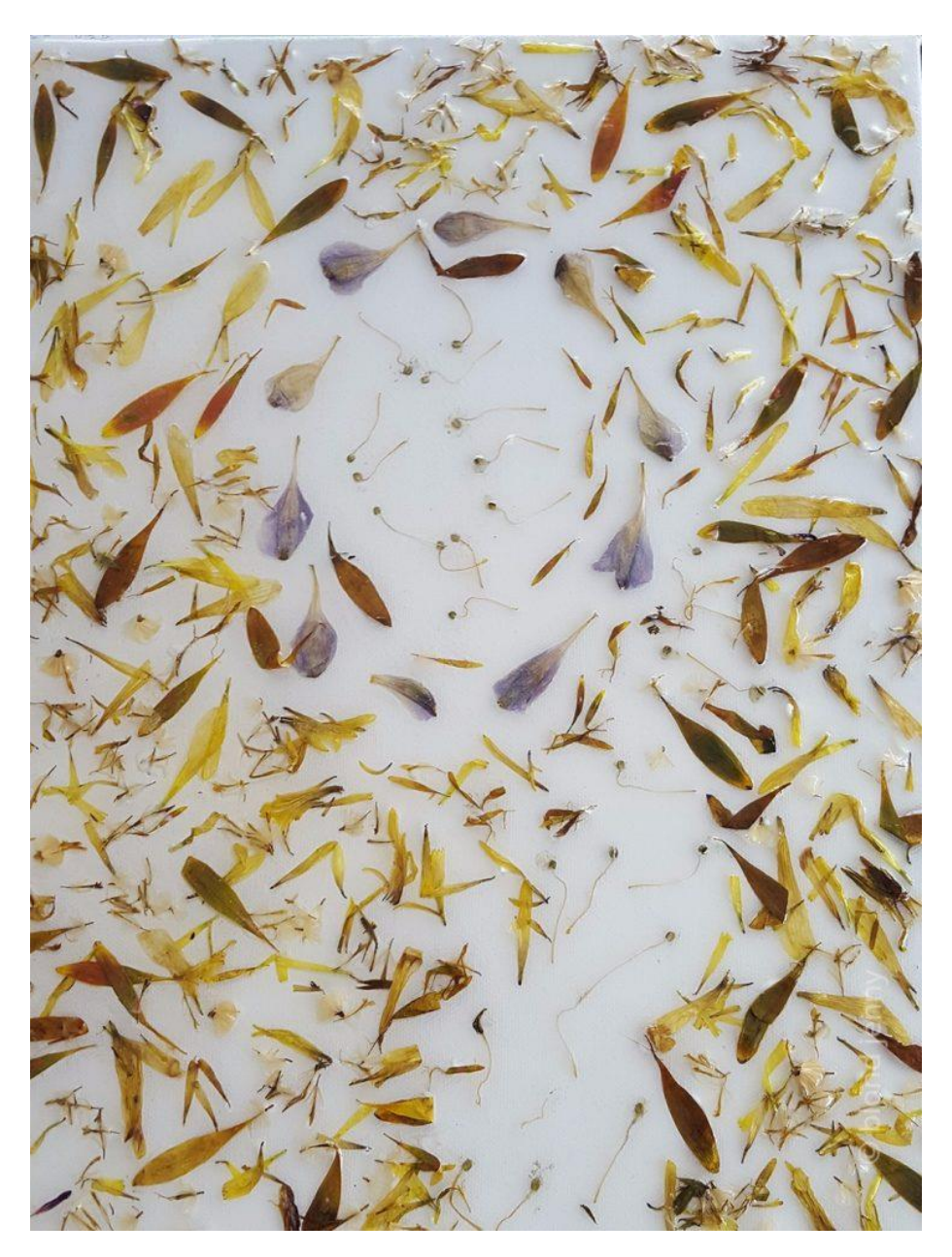
Blond Jenny Nature Drawing #2, 2017 dried flower petals on canvas with resin 16 x 12 in.